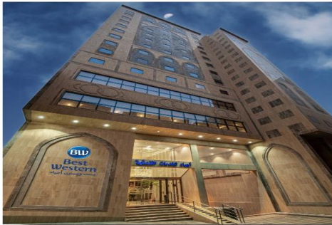
Best Western Ayyad Hotel - Makkah