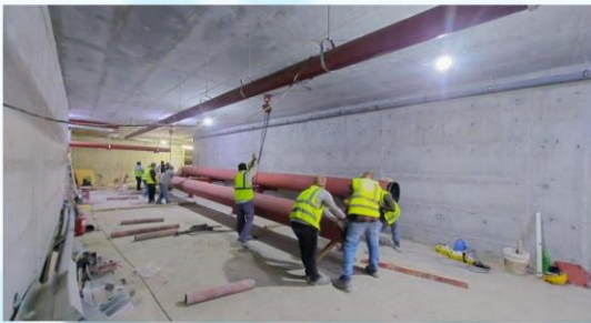
Chilled Water and Central Water Network - King Saud University