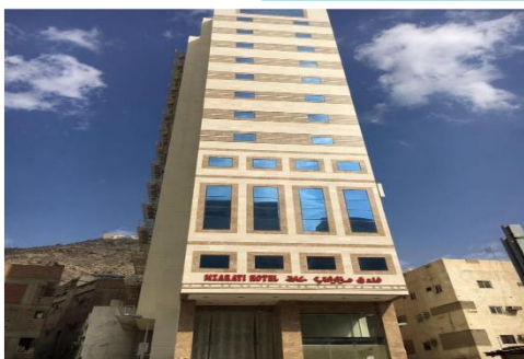
Maserati Hotel - Makkah