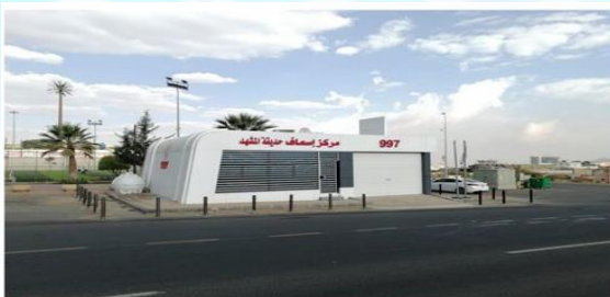
Supply and Installation of Advanced Emergency Centers - Saudi Red Crescent Authority