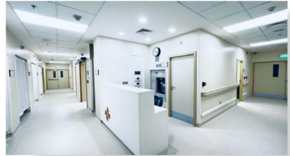
Expansion of the Medical Imaging Unit at the Main Hospital - King Fahd Medical City