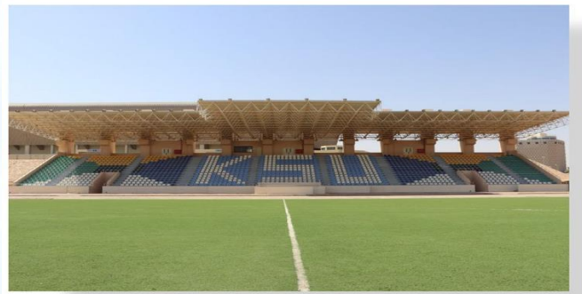
Rehabilitation of the Sports and Scouts Area - King Saud University