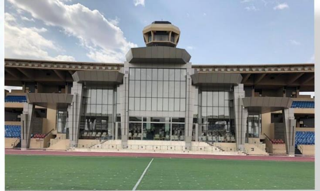
Construction of the VIP Platform - King Fahd Security College