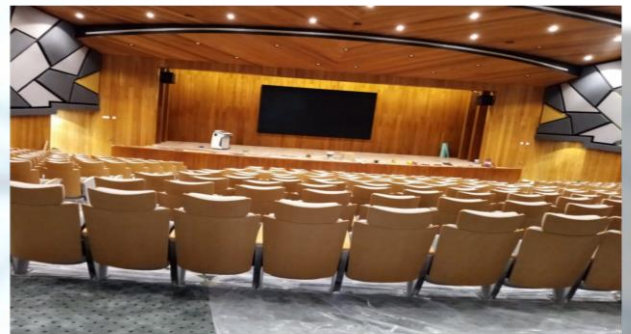
Rehabilitation, Equipping, and Furnishing of the Grand Celebration Hall in Jubail - Saline Water Conversion Corporation