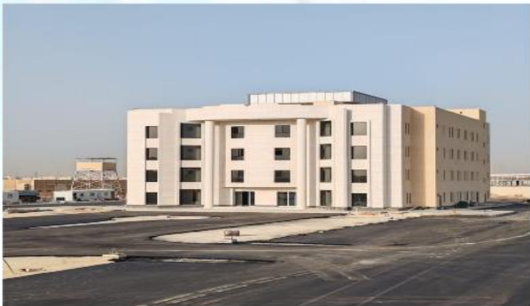
Additions and improvements to the Supply and Logistics Affairs building in the Riyadh region - Public Security