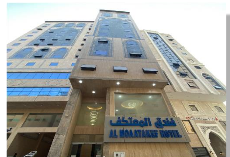
Al-Mu'takif Hotel - Makkah