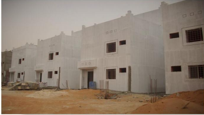
Construction of Residential Units for the King Salman Charitable Housing Association - Al-Kharj