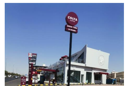
Imam Bukhari Street Project, Medina