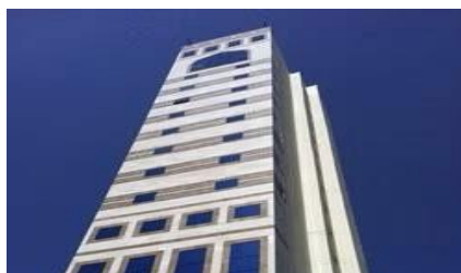
Mazarati Tower in Makkah (Mecca)