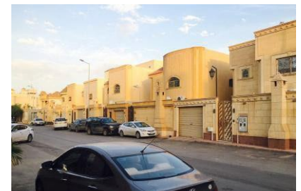
Al-Falah Villas in Riyadh