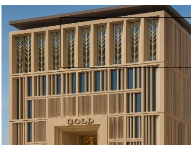
Gold Market Project in Medina