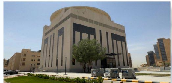
Expansion of the Emergency Department at the University Medical City - King Saud university