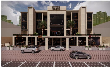
Centeria Hotel Riyadh