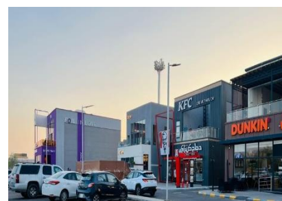
King Khalid Street Project, Medina