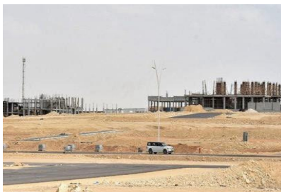
Al-Nakheel Master Plan in Al-Jouf