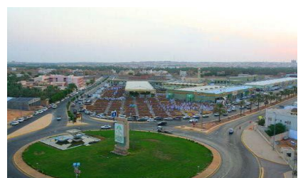
The New Vegetable Market - Anizah