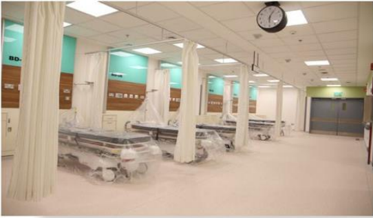
Development of the Endoscopy Unit - King Fahd Medical City