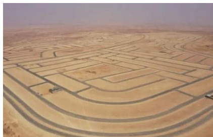
Al-Naseriyah Master Plan in Al-Raidah