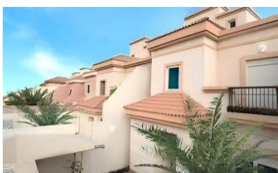
Al-Qaswaa Villas in Al-Madinah Al-Munawwarah