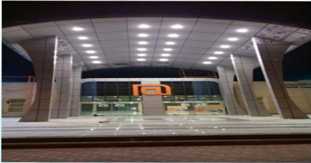
Qualifying, equipping and completing the Damman branch of the Electronic University