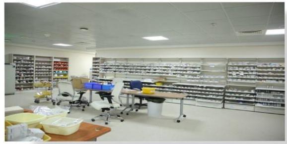
Expansion of the Inpatient Pharmacy at the College of Medicine Building - King Saud University